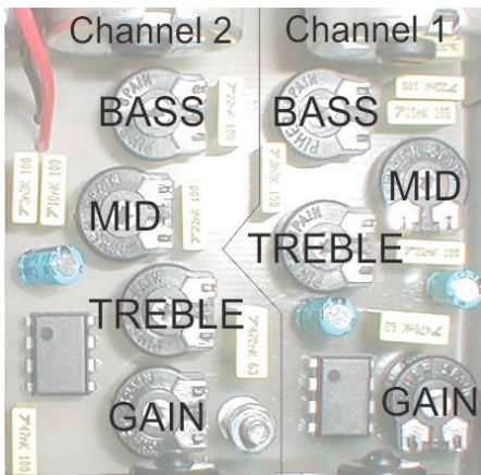
Channel 1: Wing Transducer Channel 2: Fingerboard Transducer

Once each channel has been individually adjusted to your preference, they can be blended using the external volume controls. You may wish to leave the preamp open to continue making adjustments, to fine tune each channel's bass, treble, and gain controls, as well as your amplification system, to achieve the response you prefer.